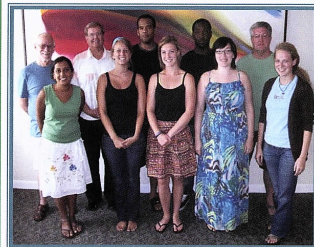
ICA staff and students from the Service Learning Program.