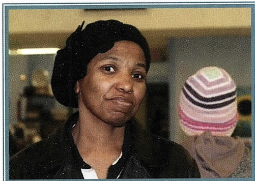
Women find support at Sarah's Circle