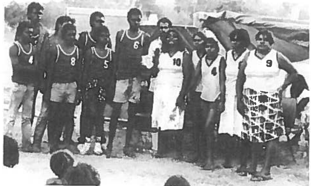
4. The champion basketball teams.