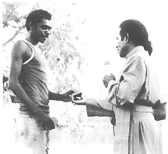
5. Bishop Isaac Gadebo, of Papua New Guinea presents the basketball trophies.