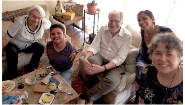
ICA Chile colleagues at their weekly meeting