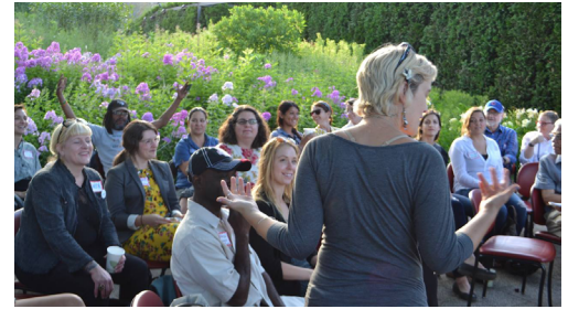
CSLN members in discussion at Lurie Garden

CSLN launched in October of 2013 as a continuation of the ICA's accelerate77 initiative and will be celebrating its fifth year anniversary this year.