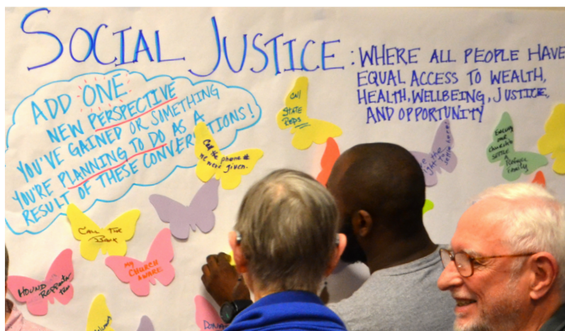
Participants write actions they're inspired to take after the conversation on butterflies, a symbol for immigration advocates

Porter detailed the ongoing disinvestment in and tightening of policies regarding refugee resettlement and urged participants to take action.