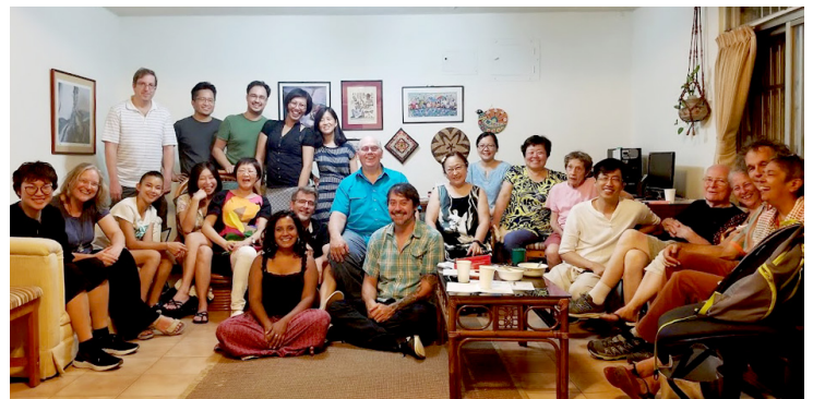
ICA Taiwan staff and colleagues gathering

Read more about the work of these international colleagues at www.ica-international.org .