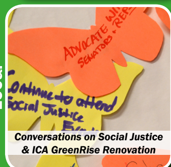
Conversations on Social Justice & ICA GreenRise Renovation

4750 N. Sheridan Rd. Chicago, IL 60640 773-769-6363 | www.ica-usa.org