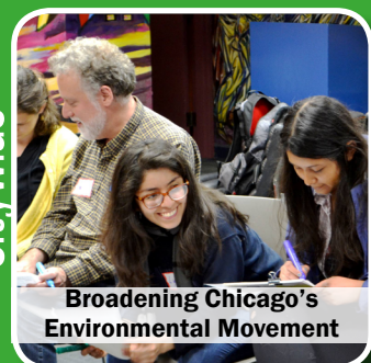
Broadening Chicago's Environmental Movement