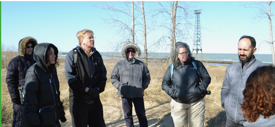
Tour of Montrose Beach Dunes on the Green Infrastructure tour.