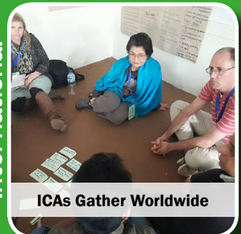
ICAs Gather Worldwide