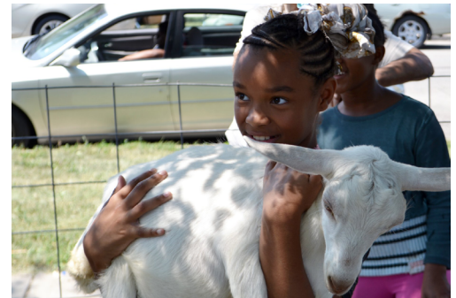
Young goat caretakers share their story at the second Nourish (comm)Unity event

CSLN members have been continuing to shape the environmental movement in Chicago by moving past old paradigms of competition among organizations, communities, and neighborhoods to a new vision of collaboration, mutual support, and collective voice. In particular, CSLN emphasizes a race-forward and equity-focused lens as an example to others in the environmental movement. If past successes are any indicator, CSLN will continue to innovate and thrive into the future. Learn more about the CSLN at www.accelerate77.net/CSLN .