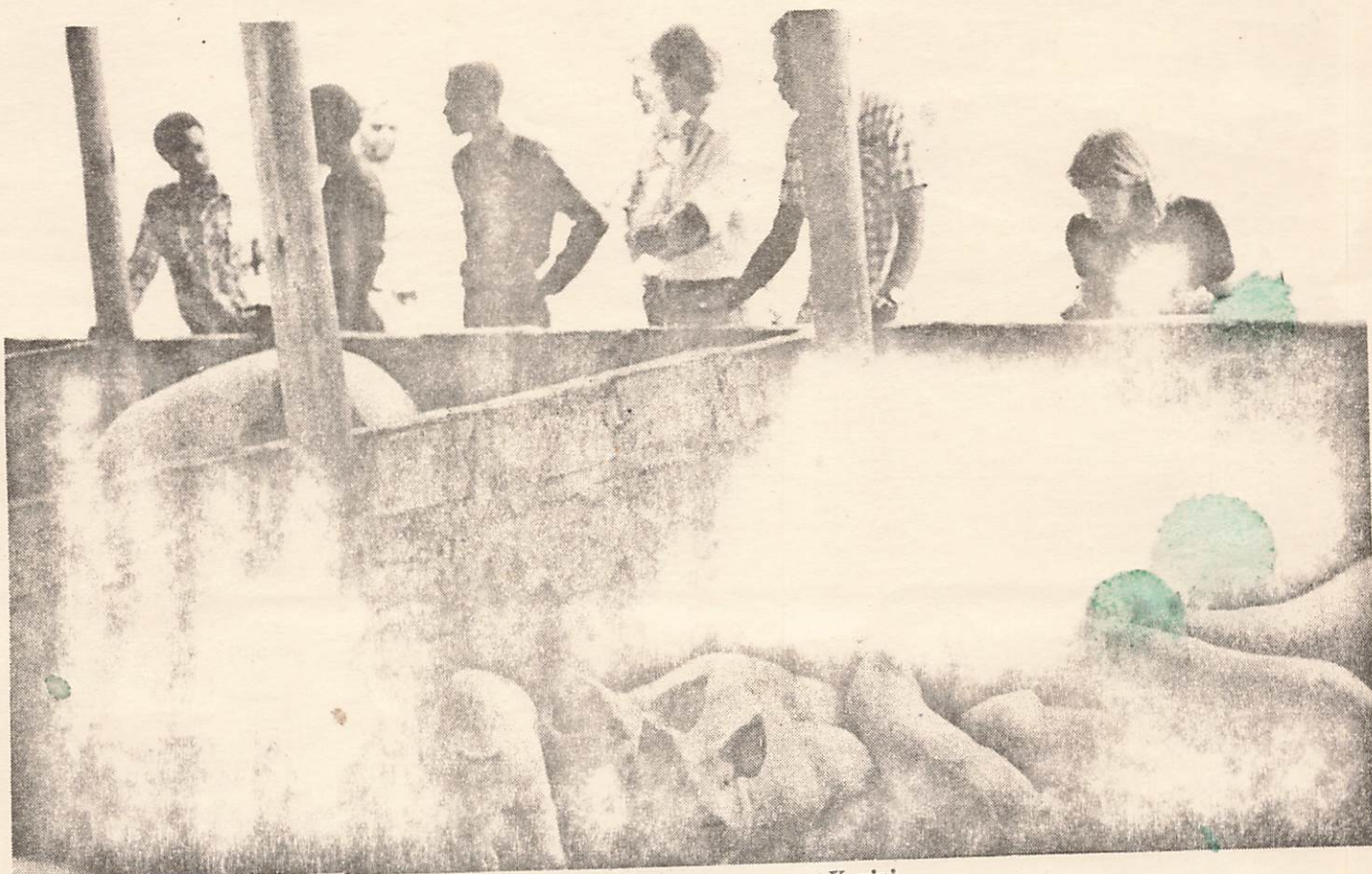
● SOME of the pigs at the piggery at Kapini.