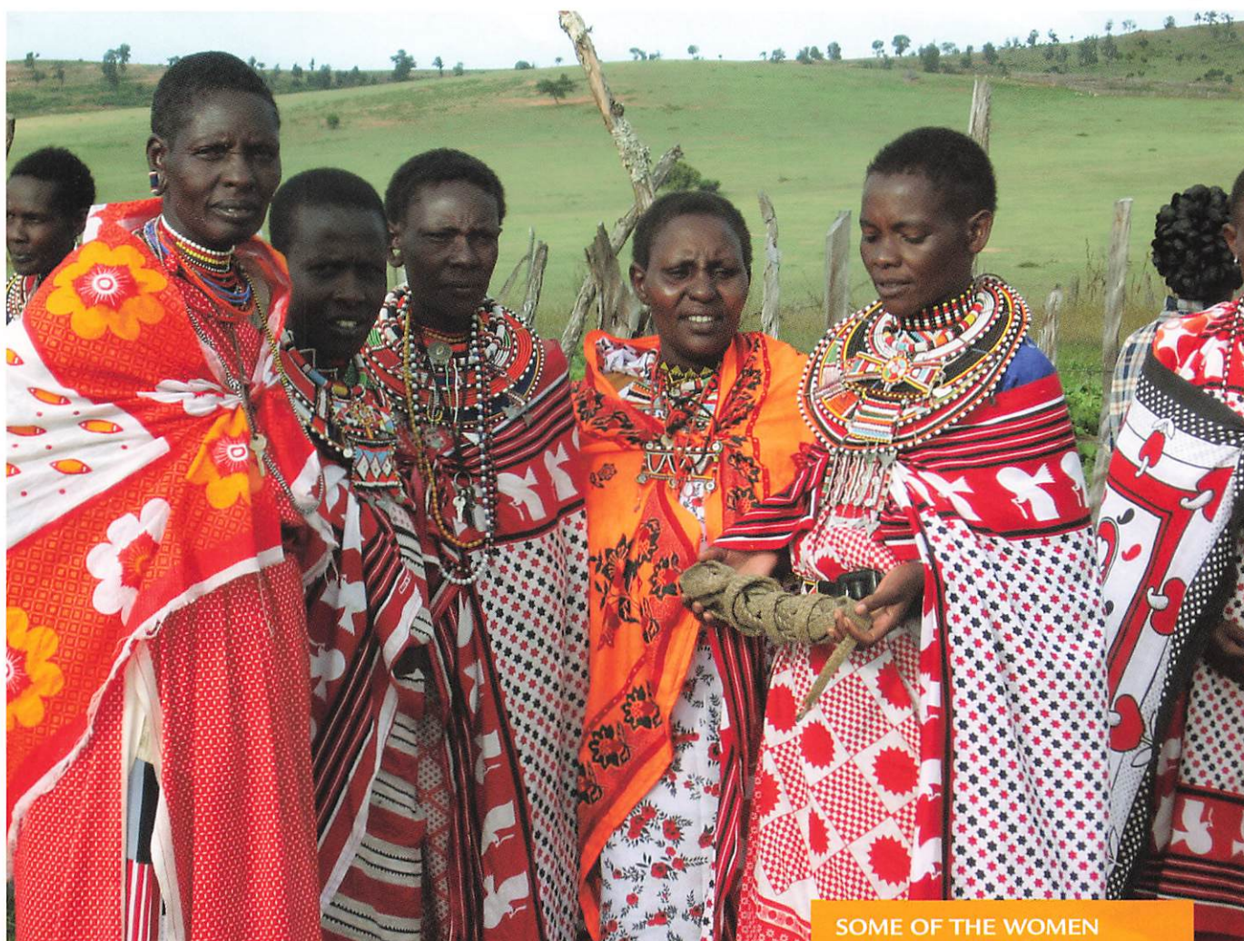
SOME OF THE WOMEN OF IL NGWESI

“If the program ends somewhere there [outside of Il Ngwesi], it’s fine,” one said. “It won’t end here on this side.”