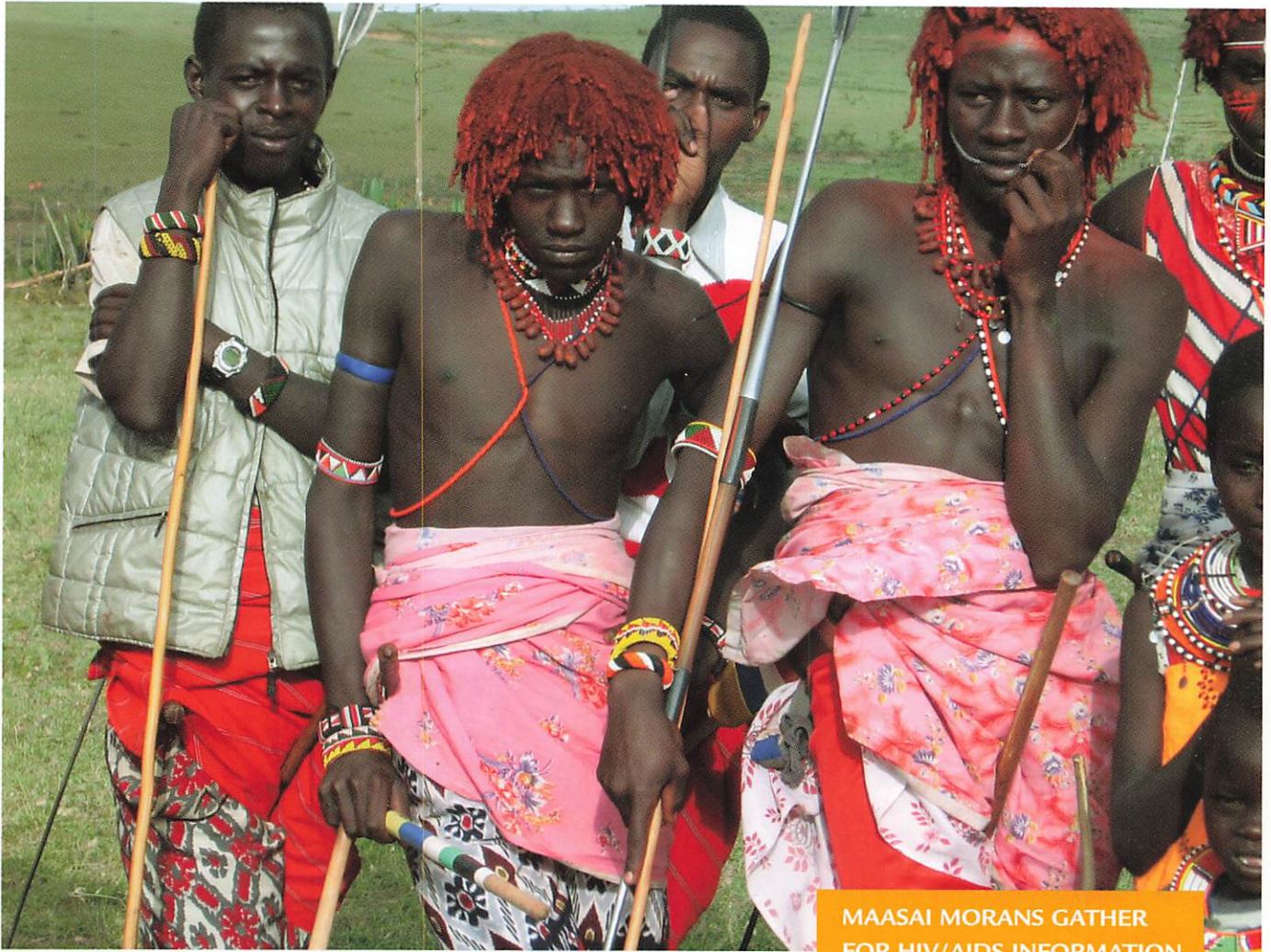
MAASAI MORANS GATHER FOR HIV/AIDS INFORMATION SESSION