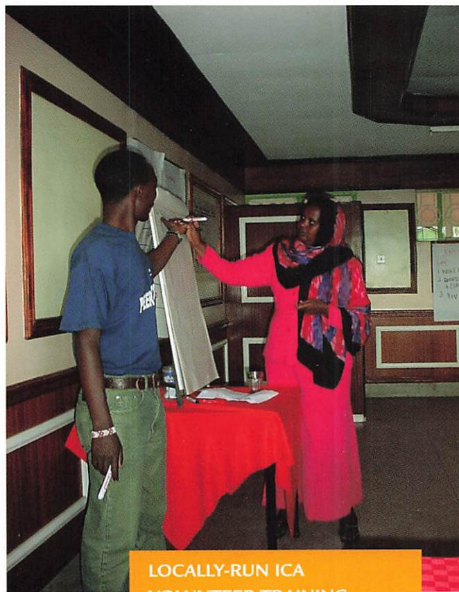
LOCALLY-RUN ICA VOLUNTEER TRAINING SESSION

The changes go even deeper, though. The Hagerman study found that young people considering marrying or becoming sexually involved go for counselling or testing beforehand.