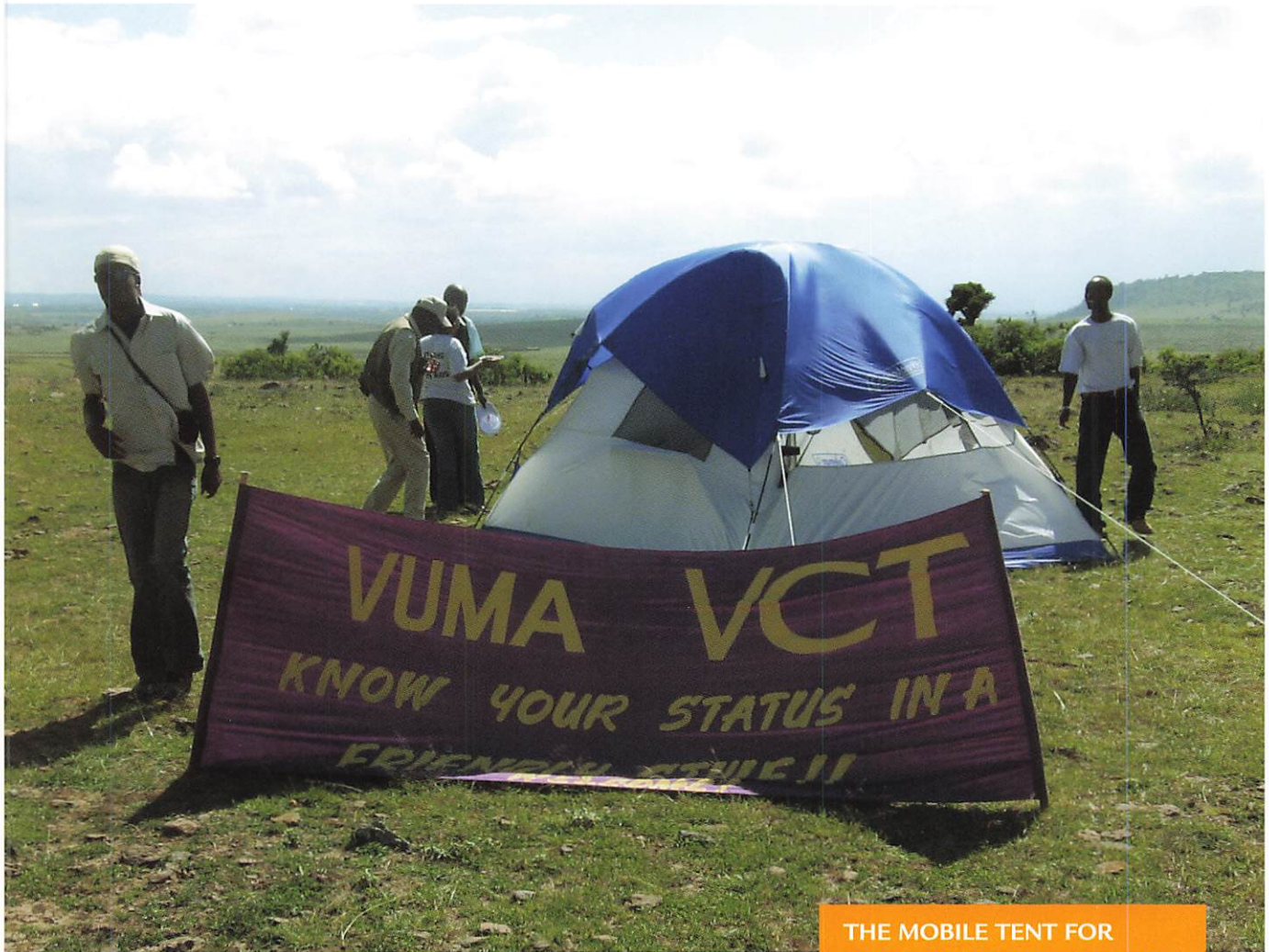
THE MOBILE TENT FOR COUNSELLING AND TESTING