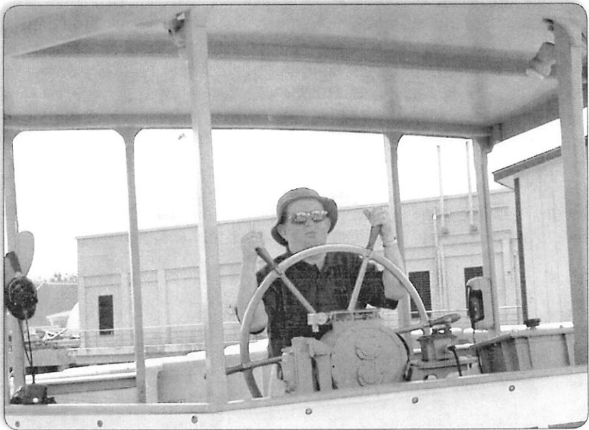
Oh to pilot my own ship!