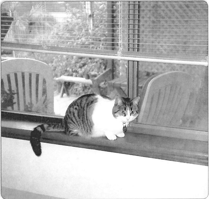
Heidi, our cat