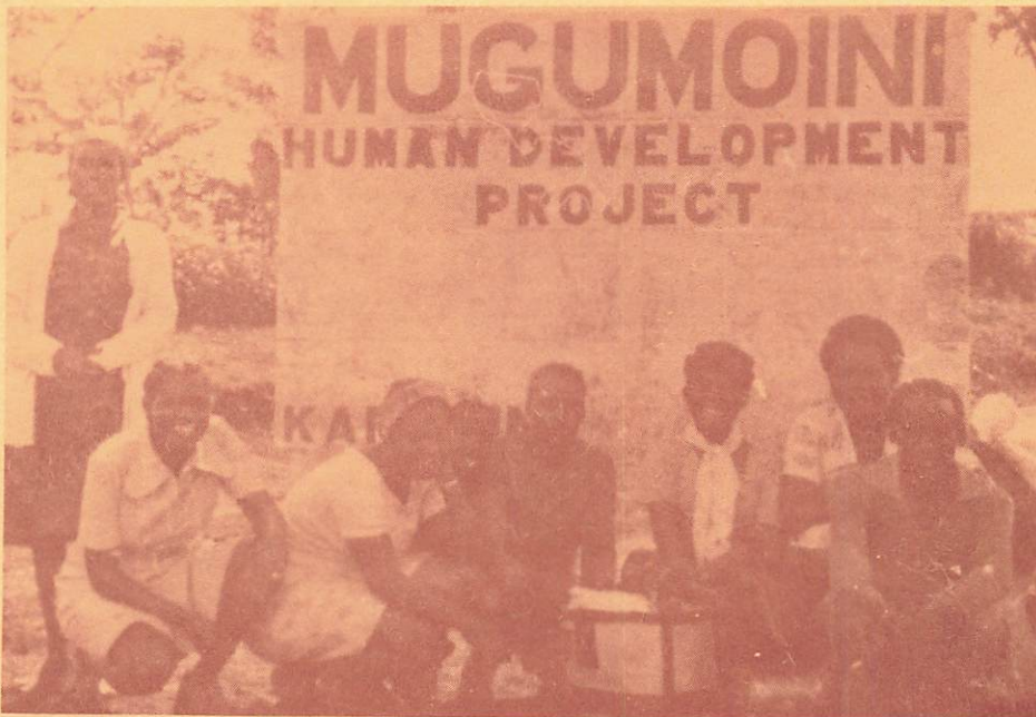
In Mugumoini the villagers and government officials are working together in a new way.