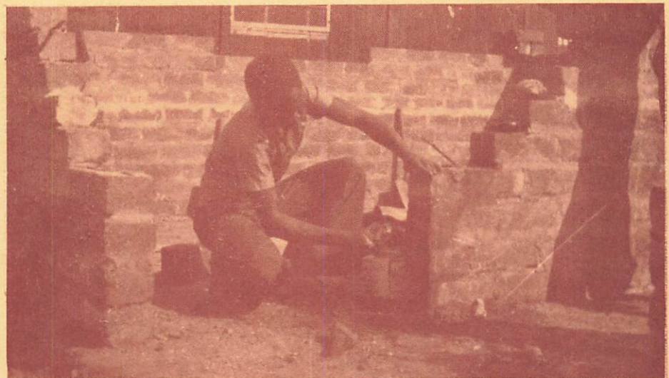
Kamweleni is the site of staff training and planning