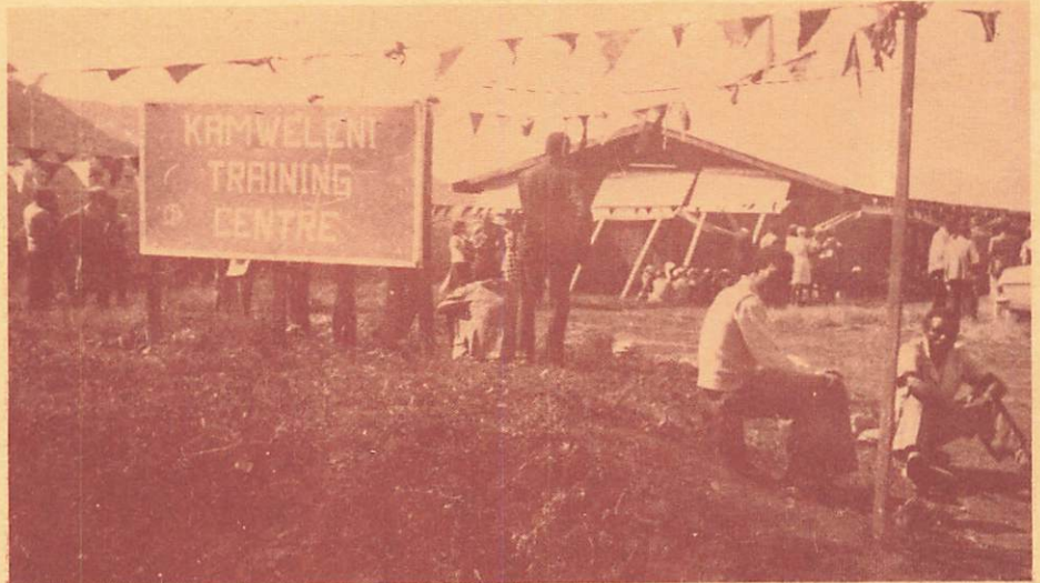
The community helped construct the Kabiro Clinic