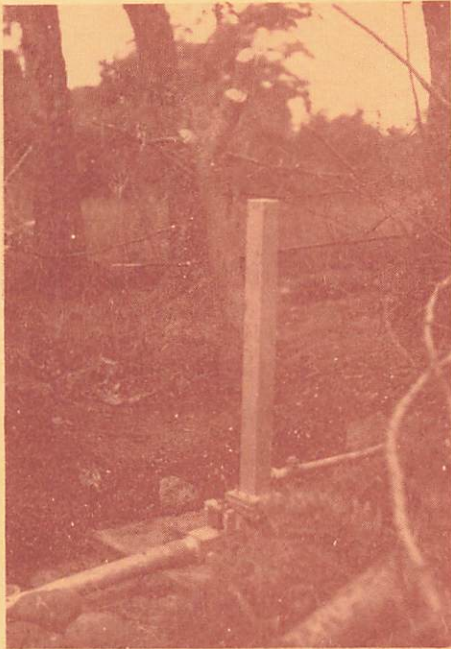
The hydrolift dip-pump in Samutet-Chemabei efficiently and inexpensively provides a clean water supply for the cattle dip.

These projects were initiated through one-week consultations in January 1981. The following represents some of the accomplishments achieved by the villagers during the first six months.