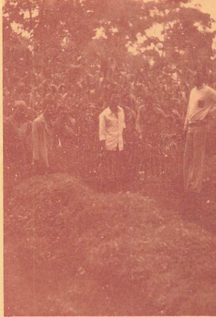
This demonstration seed bed in Kalwani-Shamalago, similar to the one in Kaongo, increases the variety of food crops available in the village.