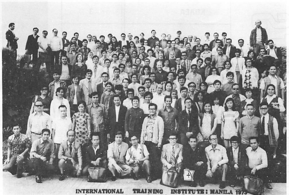
INTERNATIONAL TRAINING INSTITUTE: MANILA 1973

BAGUIO CITY: AUGUST 12 - SEPTEMBER 1, 1973