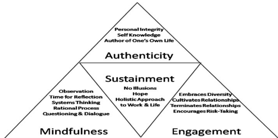
Fig. 1 Framework for ethical leadership