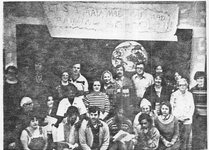
First week faculty and participants pose in front of earthrise.