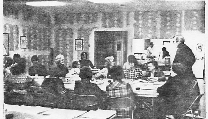
Noon leadership skills session meets in new Lorimor Community Center.