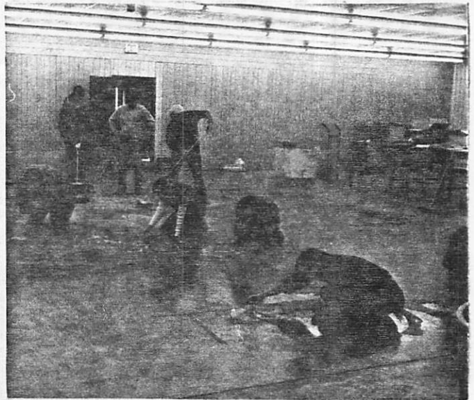
Participants and staff experience the power of corporate effort on workday.

Lorimor clearly played a role in the success of the school. The obvious accomplishments and yet obvious struggle of the community set a tone of seriousness and possibility. Dealing with real issues and real people made the cycles and labs authentic. And finally, the presence, openness, and commitment of Lorimor people gave the entire school a deep sense of hope for local communities.