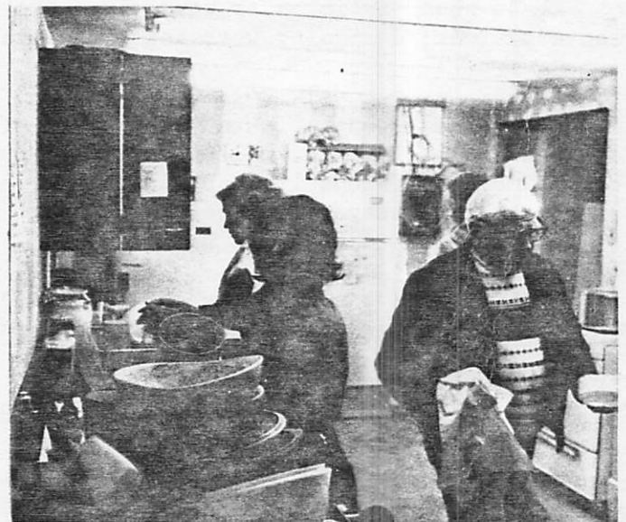
Kitchen and enablement tasks were done by team rotation.