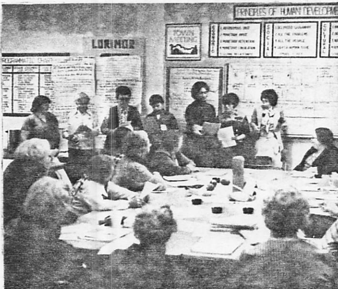
Neighborhoods report the results of their forums and share insights.