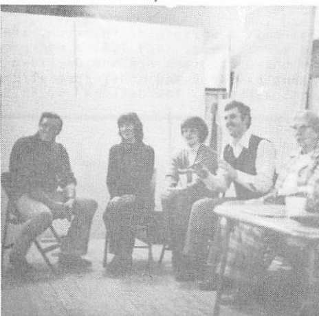
Teamwork is an essential part of the training school.