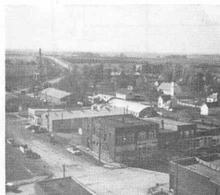
Lorimor is typical of many rural communities in the midwest.

Students and faculty work closely together in teams, both in the classroom and in the community, forming an essential collegiality in the life of the school.