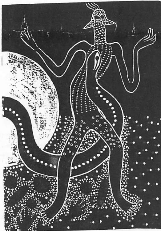
Illustration by Arone R. Meeks Aboriginal Land Council NSW, Australia