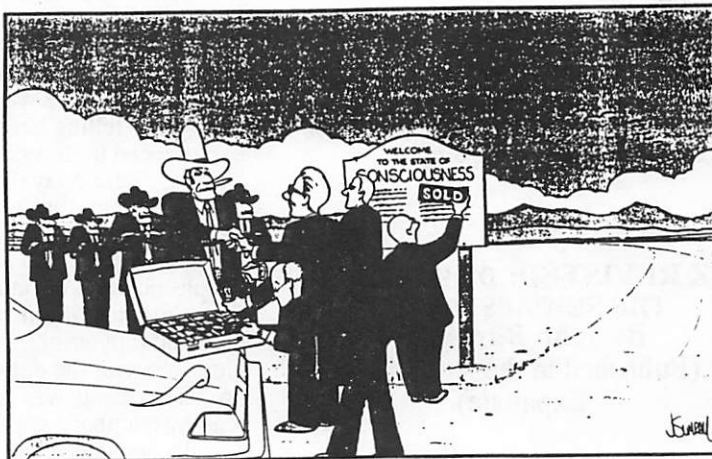
Completely fed up with the whole "New Age" thing, billionaire Bob purchases the entire state of Consciousness.

Environmental Focus, the Toronto-based environmental support organization, says modern energy-efficient buildings may save on energy costs but lack of