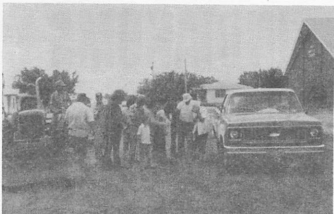
Community Workday on Main Street