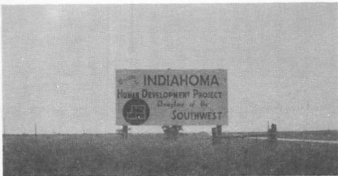
Entrance Sign to Town