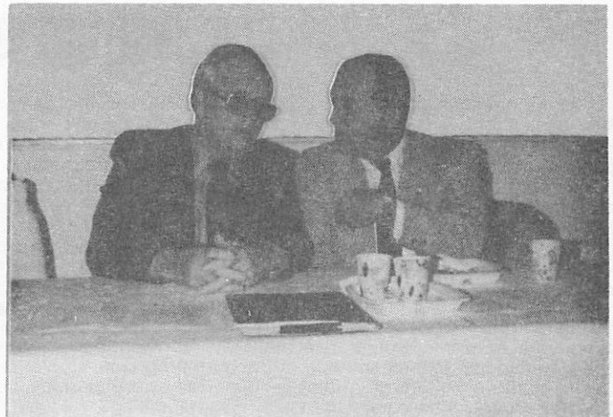
Lt. Governor Bernard & Rep. Harper