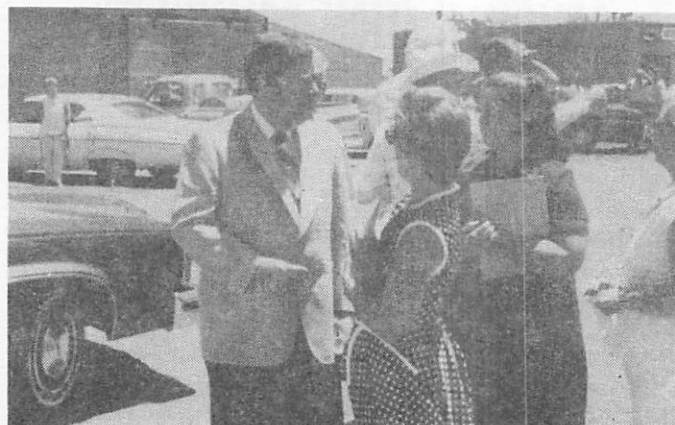
Governor Boren Visits