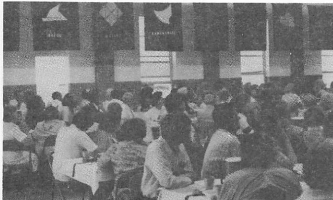
300 people attend opening Consult Feast

The Institute of Cultural Affairs has been working in Oklahoma since 1970. Over 150 communities throughout the state have participated in the Town Meeting Program. After three community meetings the City of Indiahoma decided to become the Indiahoma Human Development Project inviting the Institute of Cultural Affairs to work with its citizens for two years with a resident staff of four people. Indiahoma was selected because the town had potential for development, its plight was typical of other small southwestern towns on the economic decline and most of all, there was a group of interested residents.