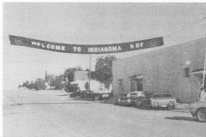
Showplace Boulevard Welcome Banner

INDIAHOMA, OKLAHOMA FIRST YEAR REPORT-JUNE 1979