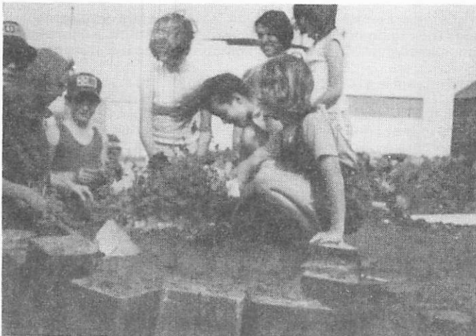
Heritage Plaza Planter get Flowers